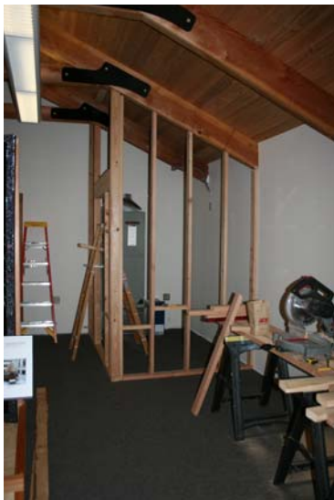
Furnace closet under construction

Eureka! We are so happy the project is complete. We now have a place to preserve artifacts and to provide a pleasant space to welcome staff, community and tourists.