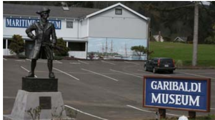
New sign fronting on Hwy 101