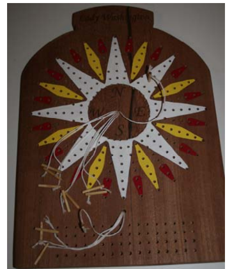
Traverse board on display

Several other new exhibits are on display including traverse boards for the ships Lady Washington and Columbia . A traverse board was an instrument used to record sailing direction and speed. The traverse boards are a gift from Kent Wall of Gray's Harbor, WA, home of the tall ship Lady Washington .