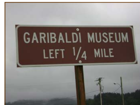
ODOT sign facing north