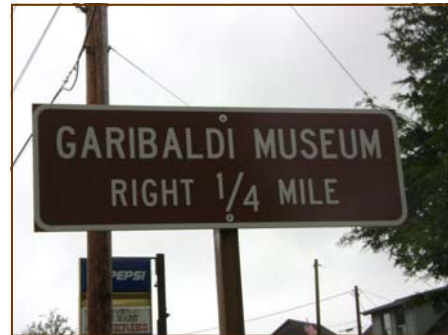
ODOT sign facing south

The Oregon Department of Transportation installed two new signs alerting visitors to the museum as they drive through Garibaldi. The signs are located a quarter mile north and south of the museum on Highway 101. The signs were installed at the request of the museum. Materials and installation were paid by the museum. Thank you ODOT.