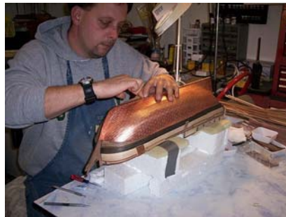
Sheathing the Columbia